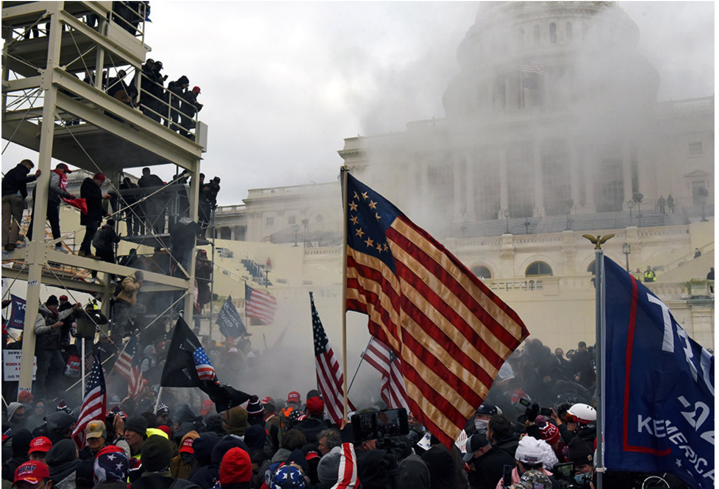
Supporters of President Donald Trump gather in front of the U.S. Capitol Jan. 6, 2021, in Washington.

The theme's description proceeded to ask, "Can we ever know what is real and who is trustworthy? Why does truth matter? And how can we reach it?"