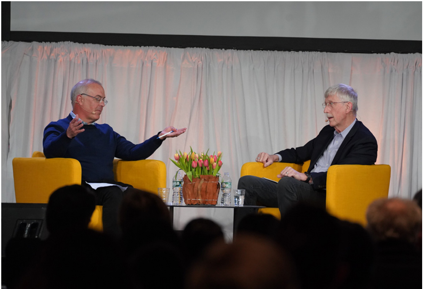
David Brooks, left, and Francis Collins speak during the panel "Can We Ever Know What Is Real?" Feb. 19 during New York Encounter.

The Encounter's reputation has grown since its more humble beginnings on a single floor rented out in the Marriott Marquis in Times Square in 2010, to its 2020 edition at the Metropolitan Pavilion located in the posh Chelsea neighborhood of Manhattan, when it reportedly hosted more than 3,000 attendees. Due to COVID-19 restrictions, the 2021 edition livestreamed its panels, performances, and exhibit presentations, in addition to hosting virtual happy hours and meet-and-greets with panel speakers.