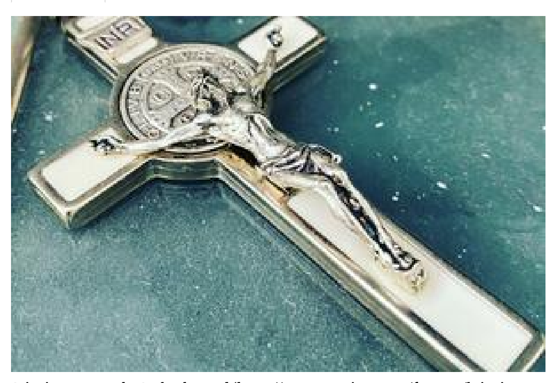
Bringing Jesus to the Brokenhearted (https://www.ncregister.com/features/bringing-jesus-to-the-brokenhearted)