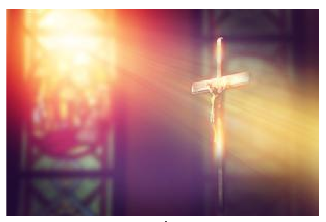
How Should a Christian Respond to Suffering? Archbishop Sample Reflects (https://www.ncregister.com/news/how-should-a-christian-respond-to-suffering-archbishop-sample-reflects)

0 \ (https://www.ncregister.com/blog/dont-waste-suffering\#coral\_thread)