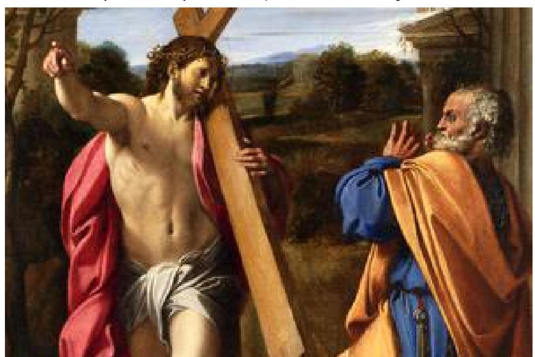
Don't Let Your Suffering Go to Waste (https://www.ncregister.com/blog/dont-waste-suffering)

"With Christ I am nailed to the cross," wrote St. Paul. "And I live, now, not only I; but Christ lives in me."